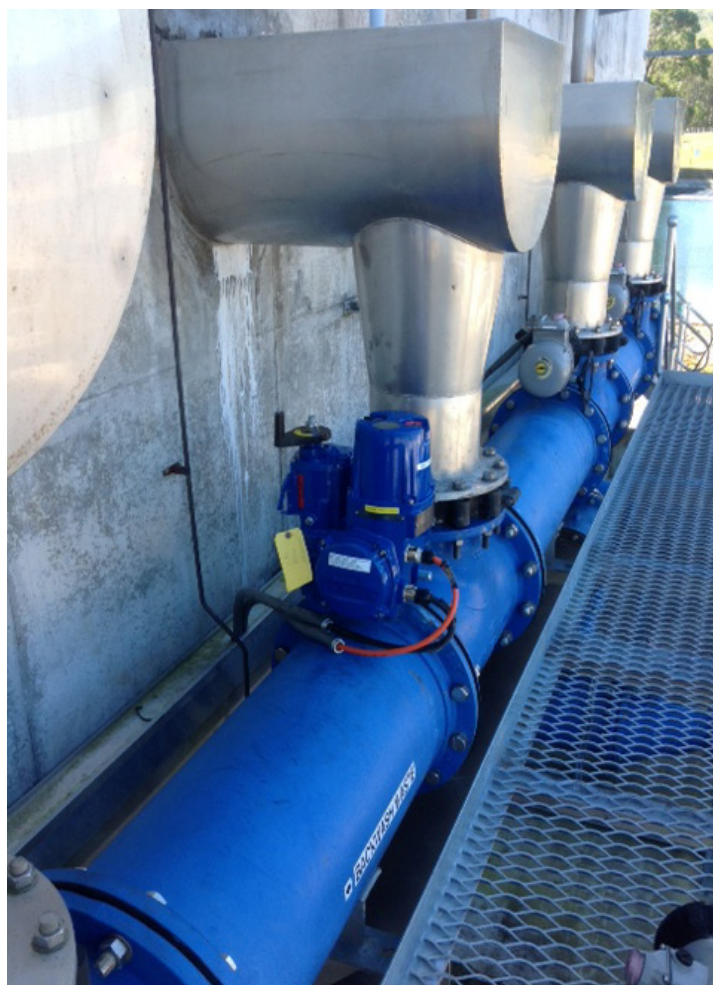
Limitorque QX on 8"600 # through conduit type gate valve

The project required 12 actuators to be upgraded to a device suitable for the environment and meet process parameters.